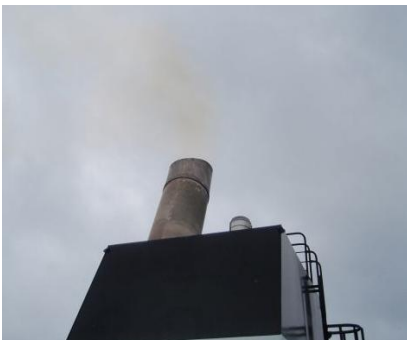
HC-3858 running as Improver

Injector – Reduces up to 20% of Nox and up to 90% of soot from your exhaust gas by using the same principal and adding up to 20% of water to your fuel