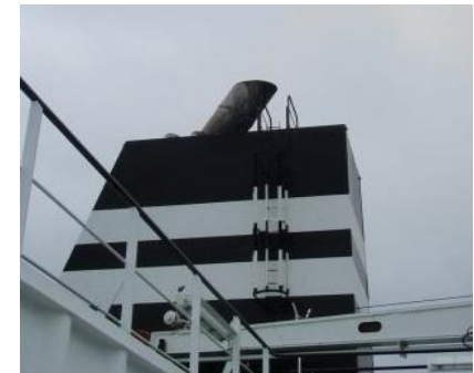
HC-3858 running as Injector